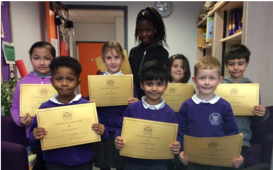
Our Buxton VIP pupils deliver exceptional work on a daily basis and we are proud of them These are our extraordinary VIPs for the month of February.

Wednesday 19th All pupil in School as normal