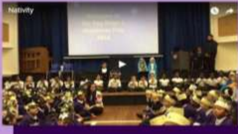
KS1 Nativity December 2016